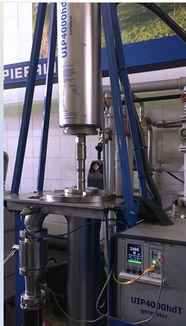
UIP4000hdT (4kW, 20kHz)