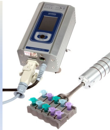
UP200St with VialTweeter

Ultrasonic Processor UP200St with VialTweeter